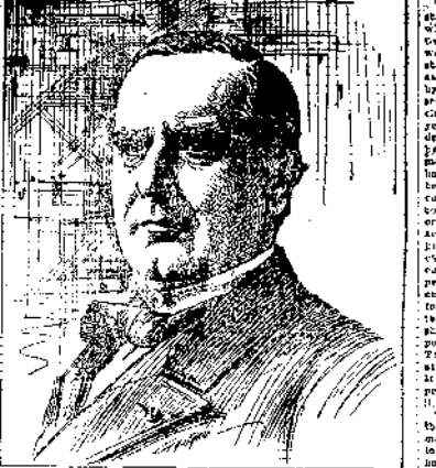
There are no other men...